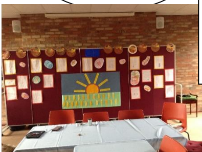
KS1 discussion – 'Where is God?'